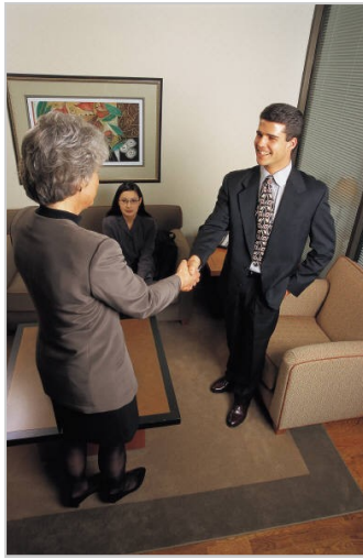
Stop in our office LaCava 270 781-891-2375